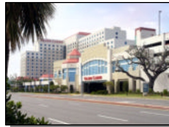
Harrah's Grand Casino— Biloxi, MS