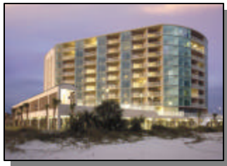
Sea Breeze Condominiums— Biloxi, MS