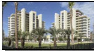
Harbor Landing Condominiums— Destin, FL