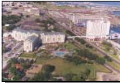
Grand Casino Resort— Gulfport