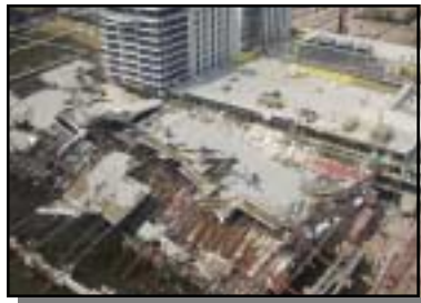
Hard Rock Hotel and Casino— Biloxi