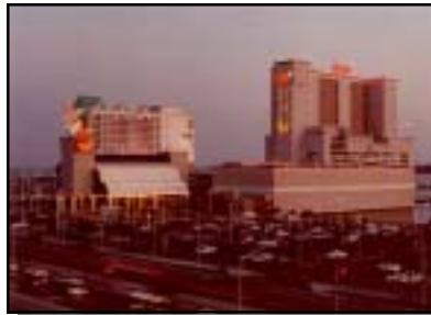
Casino Magic Resort— Biloxi