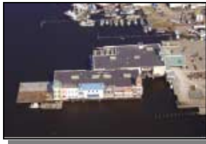
Boomtown Casino— Biloxi