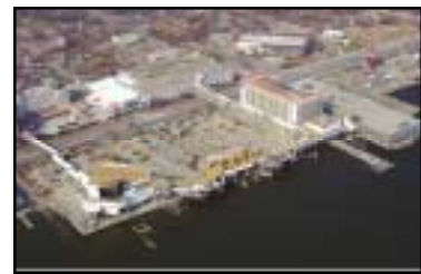
Grand Casino Resort—Biloxi