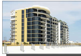
Capri Condominiums — Perdido Key, FL