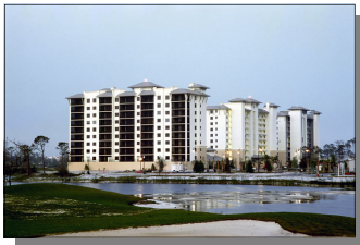
Lost Key Condominium Resort — Perdido Key, FL