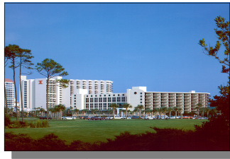
Sandestin Hilton Expansion / Addition — Sandestin, FL