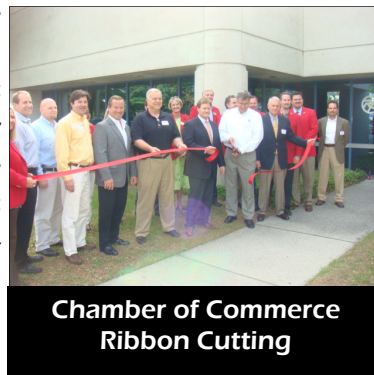
Chamber of Commerce Ribbon Cutting

tion in the Northwest Florida region, and we share similar core values in giving back to the local communities in which we work. The Opus group has also been a pioneer in the design-build concept throughout the United States and Roy Anderson Corp has similar synergies of delivering professional services to our customers."